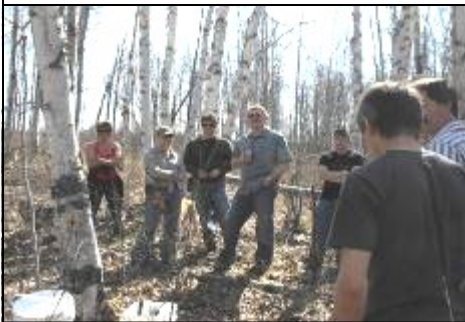
WCFA Members tour the Ladd birch forest